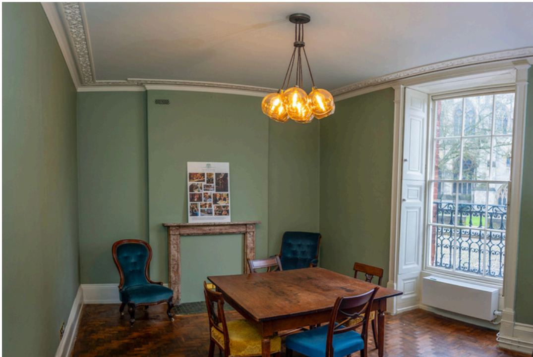
THE GREEN ROOM