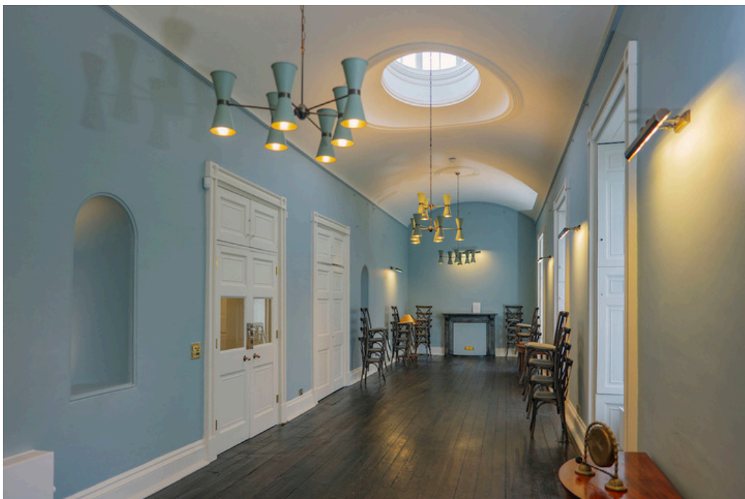
THE BLUE ROOM